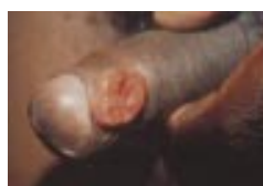
See p 452