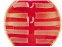
See p 468